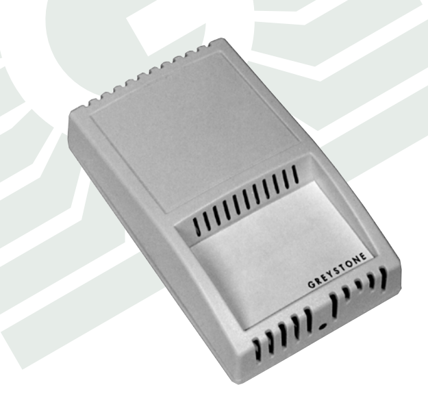
Executive Enclosure for AIR 300 (AE)

Environmental, industrial and commercial indoor Air Quality detector. Available in both space and duct mount versions.